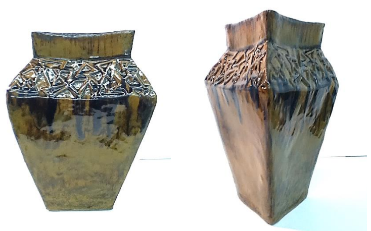
Title: Tetrahedron by Tyler Dupee

Description: Representing the ability to progress and evolve, Blue Herons send a message to people about self-reliance. After constructing the slab coil vase, porcelain slip was applied to the surface. Once the slip dried, the blue herons were carefully carved through the slip. After the birds were completed their ecosystem was carved into place. This vase also displays the strength and pride of being an individual and standing alone.